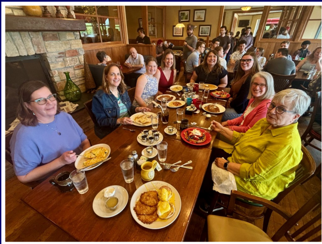
Sunday School Teacher Thank You Brunch at The Original Pancake House, May 17, 2026