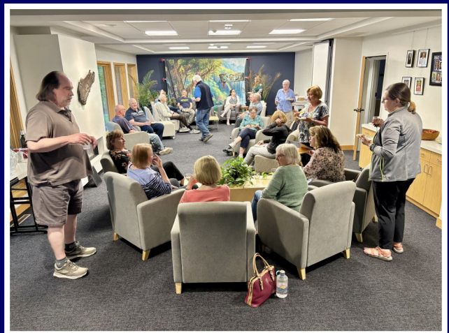
Peace Choir end of year party, May 13, 2026t