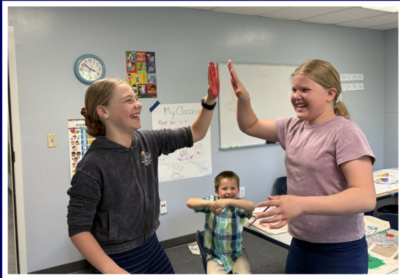
Sunday School....crafts, zaniness, and learning!