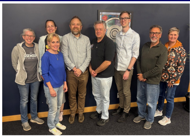
First meeting of the new 2026-2027 Church Council, May 19, 2026t

$445 was raised for The Stocking Project, Peace's Christmas gift bag initiative for women experiencing domestic violence.